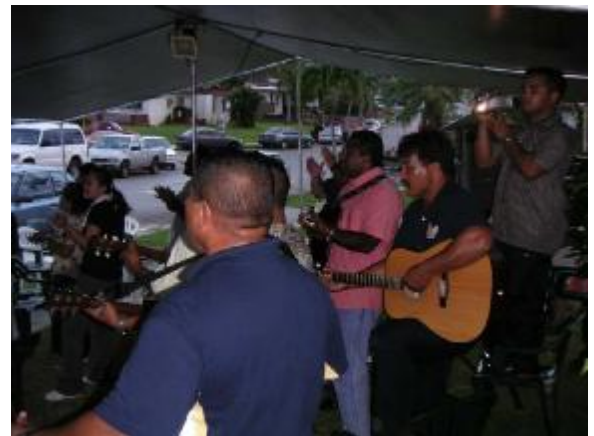
Praise and worship in front of our house

For over a year the Lord had put a burden on our hearts to organize an outreach in our neighborhood and in October with the help of others we were able to. The event was a Sunday evening worship service on our front lawn! It happened on October 31st -- a night when literally hundreds of children and adults pass by our house. The meeting was sweet fellowship with about 50 other Christians and included singing, dance, testimonies, distribution of tracts and a series of short evangelistic videos. The goal of the outreach was to proclaim the Lord's love and to show the neighbors that we are open to relationships. In the weeks following this outreach, we have had several new opportunities to talk with our neighbors. We pray that the Lord will break down the barriers to the gospel and give us more opportunities to share God's love with them. As a followup our weekly Bible study group plans to go Christmas caroling in the same area. On a similar topic, some of you joined us in praying for the vacant house next door and we are happy to report that a new family has moved in and we have had good contact with them!