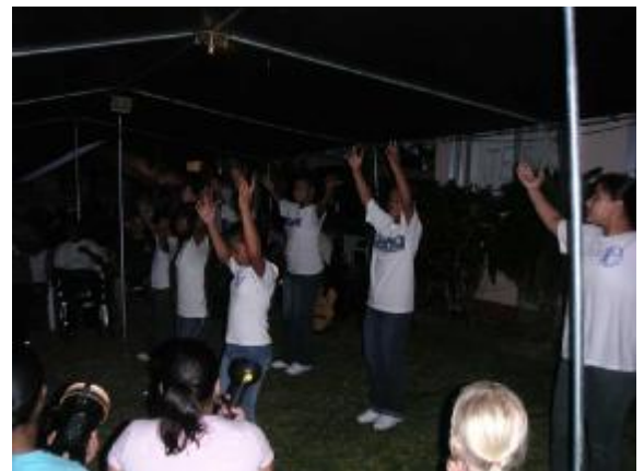
The Dance Troupe performing at the outreach