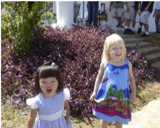
The Girls on Easter