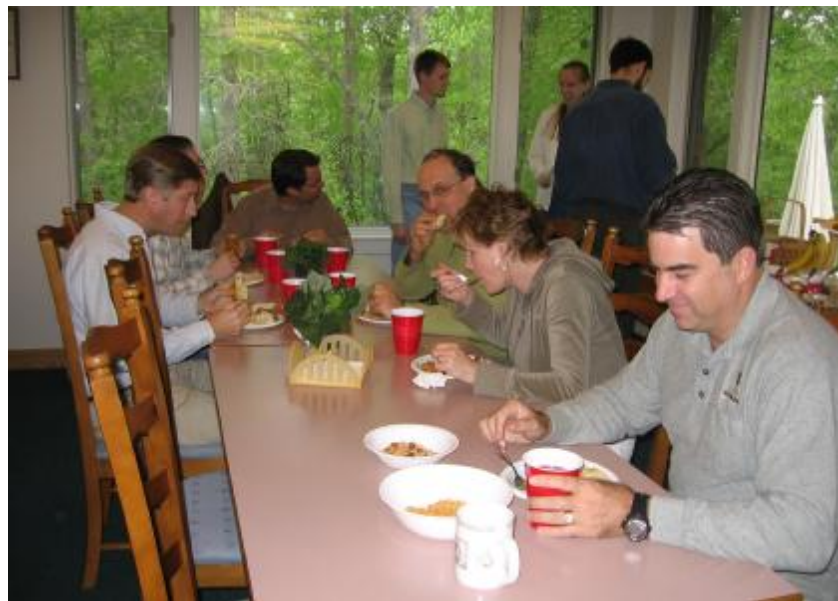
Enjoying good food at the SA meetings is a tradition!

One major event that occurred at the meeting was to bid farewell to our