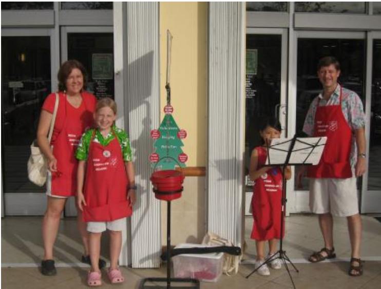
Ringling the bell for the Salvation Army

Like you, we have just concluded a very busy holiday season. We were very encouraged by the cards and gifts received from our supporters!