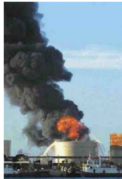
Fuel tank fires burned out of control - stopping the flow of fuel to run vehicles and standby generators

You can find additional pictures and details concerning the storm at http://www.twr.org