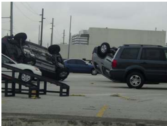
The strong winds flipped cars and trucks in parking lots

Here are a few pictures to testify to the typhoon's amazing strength: