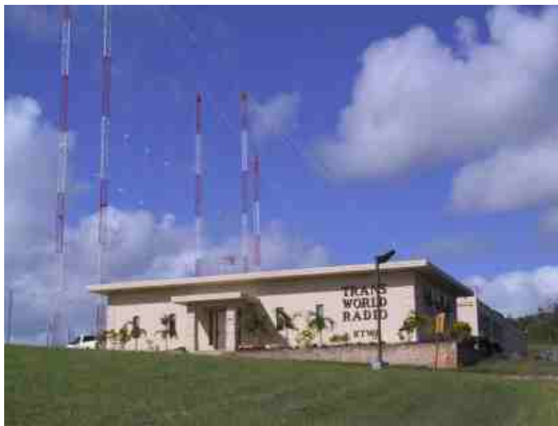
KTWR office building and part of the antenna field

Beginning in March, some of the men at the station will be working on maintenance of the antenna towers while others carry on the extra load of shift work. Since we are understaffed, and even have one family on furlough, we are glad for a short-term worker who is scheduled to come at the beginning of March. Please pray for his support, arrival, and quick adjustment to life on Guam and to the work.